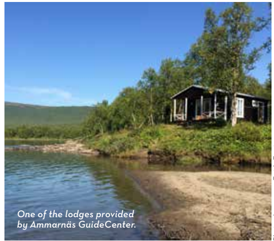
One of the lodges provided by Ammarnäs GuideCenter.

SANDSJÖGÅRDEN is found right on the shore of Sandsjön. Sells fishing permits. www.sandsjogarden.se