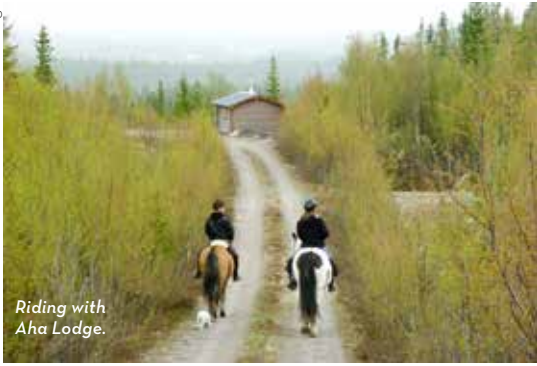
Riding with Aha Lodge.