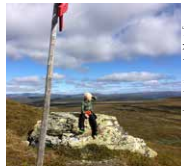
Loop trails

Ammarnäs aims to be the best hiking destination in northern Europe, and with all of the state-kept trails in the Vindelfjällen nature reserve – including the King's Trail – and the 200 kilometres of additional loop trails managed by Destination Ammarnäs we're onto a good start. The loop trails are of varying difficulty and several of them can be accessed straight from your accommodation in the village. You could make it a more challenging hike or a gentler one, suitable even for smaller children. With the loop trails, it's fully possible to start your hike in the morning and end up at a restaurant for a three-course dinner and a glass of wine in the evening.