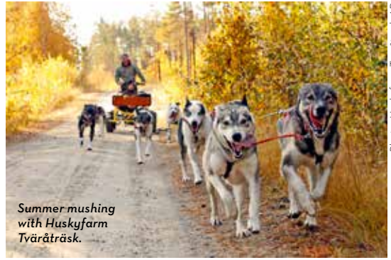
Summer mushing with Huskyfarm Tväråträsk.

SORSELE FATBIKE TOURS is the go-to place for fatbikes, and SUORGE will tell you stories about the history of Sorsele! www.suorge.com • www.pensionatholmen.se