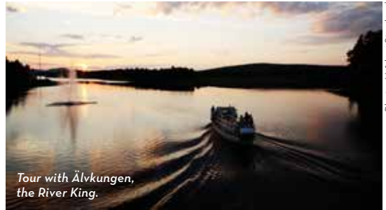
Tour with Älvkungen, the River King.

OUTDOOR-TICKET in Idbäcksheden, welcome you to meet their huskies in the kennel, maybe take part in the feeding, and learn all about the sled dog life in the winter. www.outdoor-ticket.com