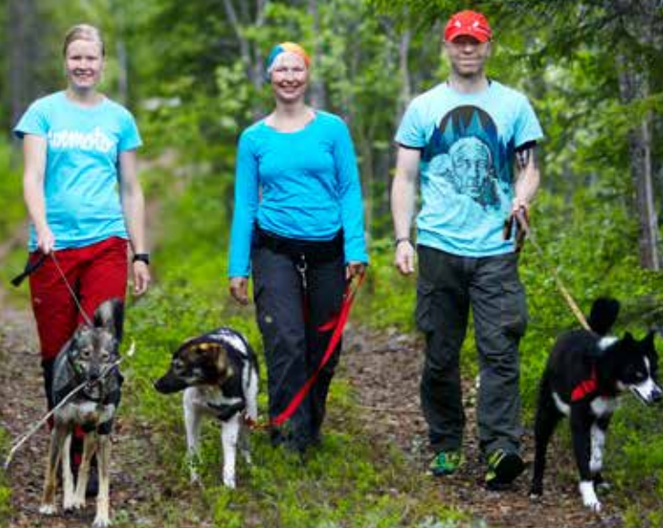
Lush forests and hilltop views – a soft hike with Cold-Nose-Huskies and their huskies is a joy!