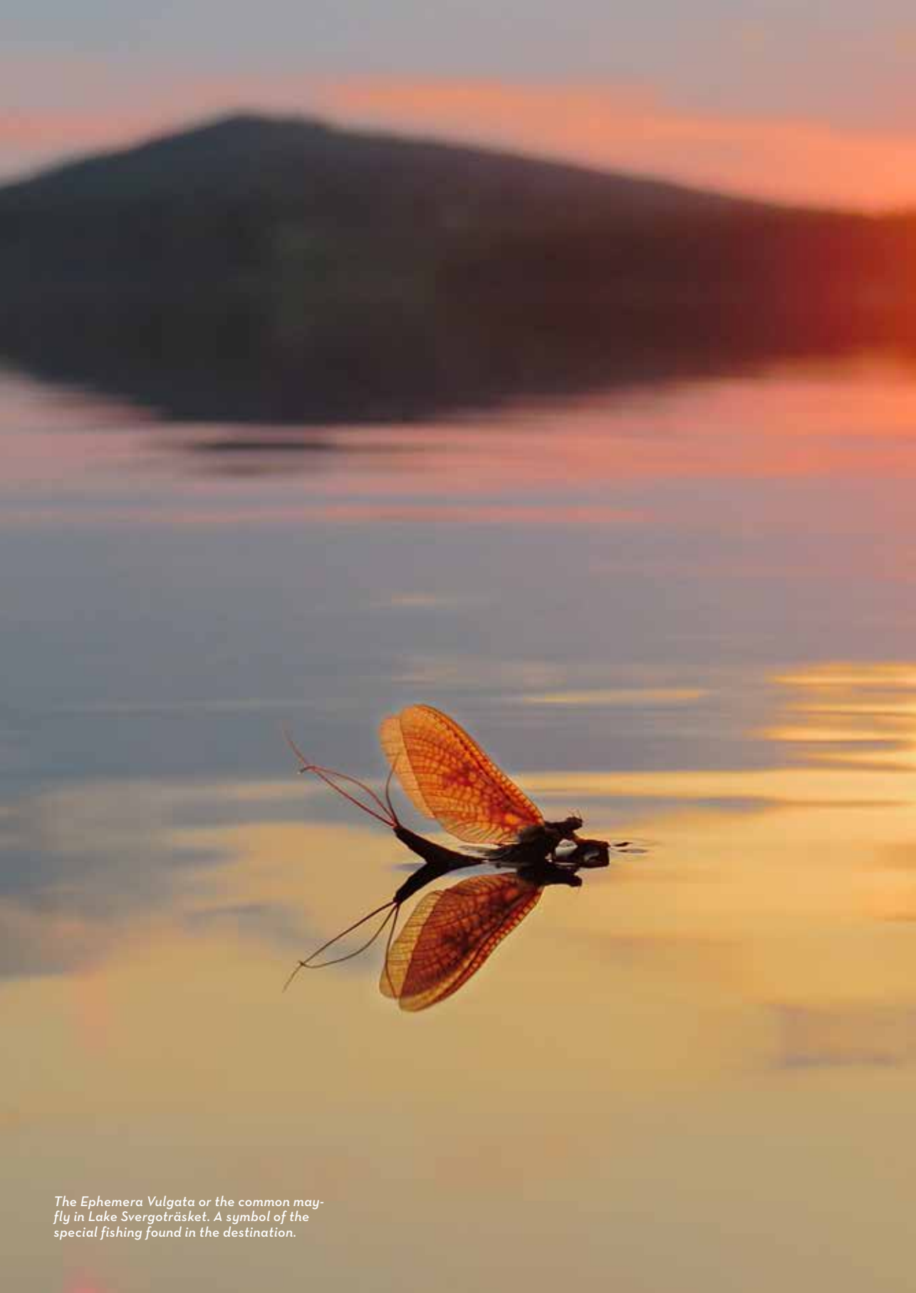
The Ephemera Vulgata or the common mayfly in Lake Svergoträsket. A symbol of the special fishing found in the destination.