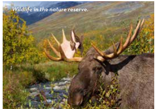
Wildlife in the nature reserve.

RIDING. The Icelandic horse has a special ability to adapt to difficult terrains, and is the go-to horse for the activity companies working with guided riding tours in the nature reserve.