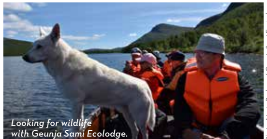
Looking for wildlife with Geunja Sami Ecolodge.